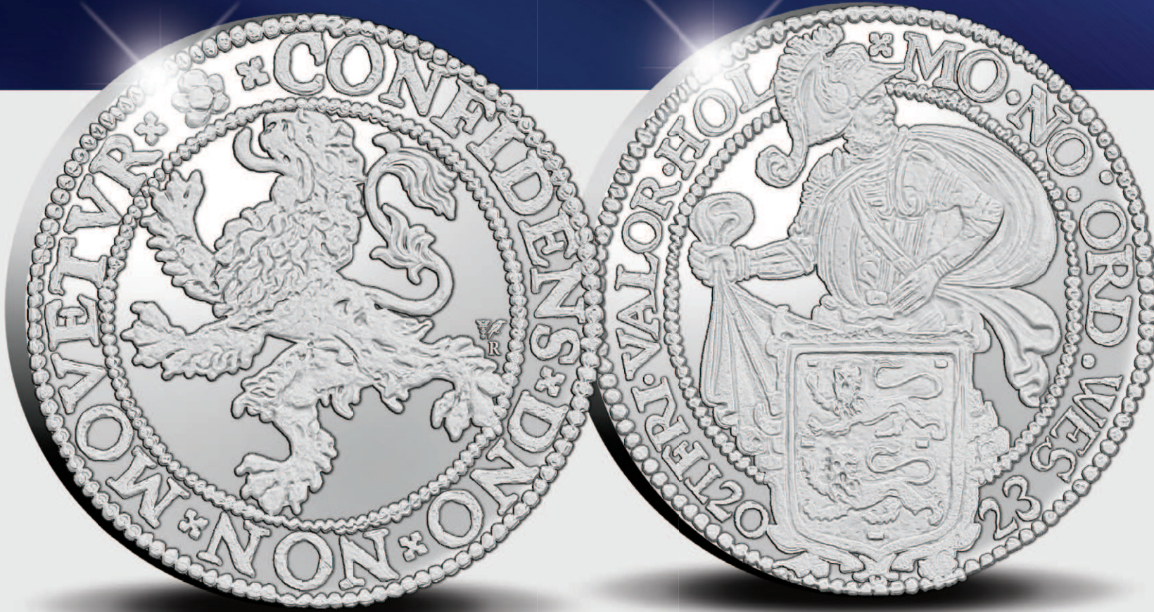
Shown larger than 38.7mm diameter