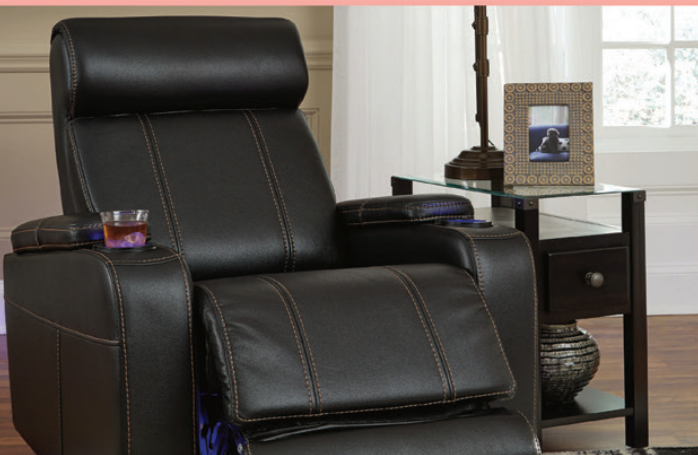
BOYBAND Power Recliner | $499