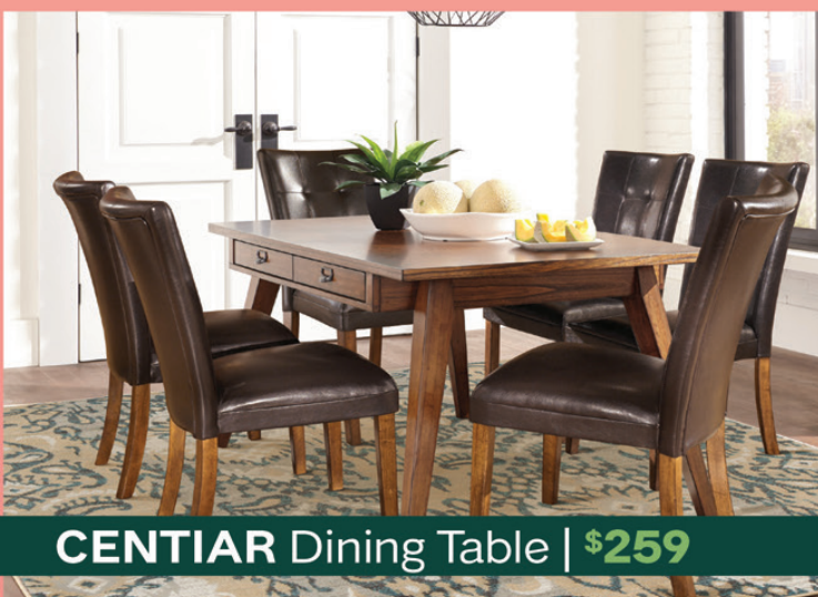
CENTIAR Dining Table | $259