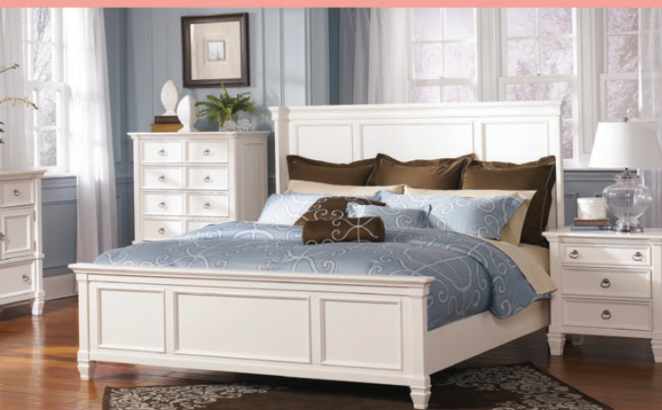
PRENTICE Queen Bed | $499