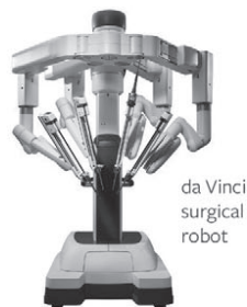
da Vinci surgical robot

Get back to what matters most. Make an appointment today.