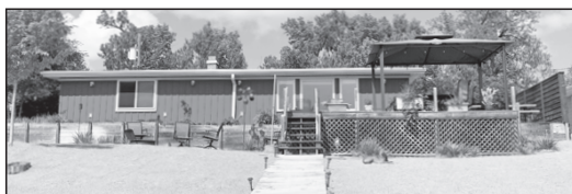
980 County Rd. W • Lot S-1137 • Fremont, NE $425,000