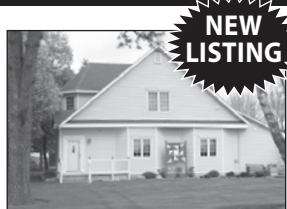
212 County Rd. B • Dodge, NE $349,000