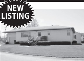
606 5th St. • Dodge, NE $84,900