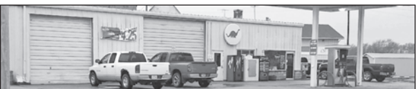
COMMERCIAL LISTING: 232 2nd St., Dodge, NE

Olson Pearson Auction and Realty has teamed up with AuctionTime and BidCaller both paired through TractorHouse to provide an online auction service to our customers.