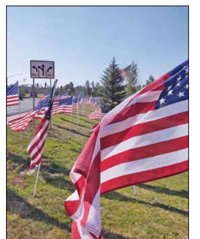
190 flags are displayed in Show Low by Fishers of Men for Veterans.