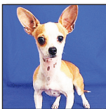
Carol female, 9-month-old Chihuahua.