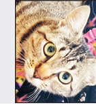
Lovely female grey/ brown tabby, small stature and loves everyone.