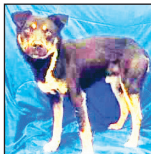
Leland male, 1-1/2 year- old, German shepherd.