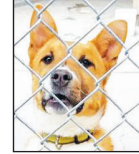
Chico , male mix breed at 8-10 months. Very playful and ready to be loved.