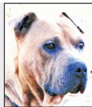
PB. 2-year-old male Terrier, pit bull mix.