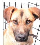
Chance , male 1-year-old shep- herd mix. Plays well with others, knows dog door.