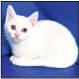
Snow female, 2-month-old, domestic short hair.