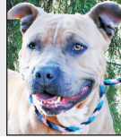
Jelly female 2-year-old terrier, pit bull mix.