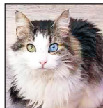
Onyx 1 male approx, 12-year-old domestic medium hair.