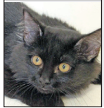
Onyx 2 female, 1-year-old domestic long hair mix.