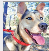
Kora 3-1/2 year old female Alaskan husky mix.