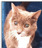
Melonie 10-year-old female domestic short hair.