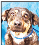
Missy 1-year-old, female shepherd.