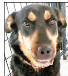
Topaz Black and tan mixed breed. She prefers to play with male dogs.