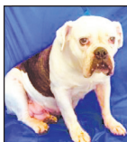
Georgia female 2-1/2 year-old purebred English bulldog.