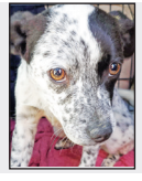
Lavender female Chihuahua/heelers mix, 12 pounds and 5-months old.