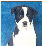
Monday female, 2-month-old retriever.