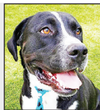
Conner male 2-1/2-year-old mastiff/terrier, pit bull.