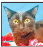
Coal Train 5-month-old male, domestic short hair.