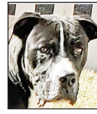
Spartacus , male 8 month to year old Great Dane mix, needs some training.