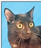
Diamond 5-month- old male domestic short hair mix.