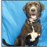
Junior male, 1-year-old labrador.