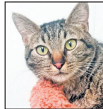
Abbey Rose female, domestic medium mix.