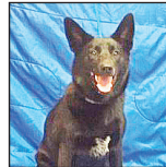
Jinx female, 1-1/2-year- old, shep- herd.lab mix.