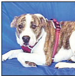
BB male, 2-year-old American bulldog.