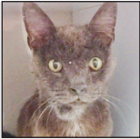
Sparrow male, 10-1/2- year-old, domestic short hair.