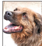
Vegas , 6-year- old male chow. Happiest kid ever. He loves people, playing ball.