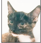
Mehitable female, 3-month-old domestic short hair mix.