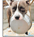
Miss May , cool- est kid at the shelter, a few years old and pitbull mix.