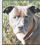
Kaylow 8-year-old male pit bull/ terrier mix.