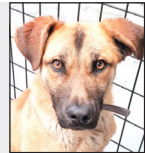
Chance , 1-year old, shepherd mix. He knows dog door and walks well on leash.