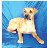
Toni male, 6-month-old, Black Mouth Cur.