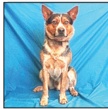
Cody male, 2-year-old Australian cattle dog.