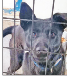
Pogo is a 1-year-old heeler/ lab, one of the happiest kids at shelter.