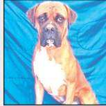
Bruno male, 2-year-old boxer.