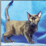
Cubby male, 7-month-old, domestic short hair.