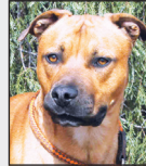
Dante 2-1/2-year-old male Mastiff mix.