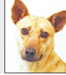
Jolina female approx. 2-year-old Basenji mix.