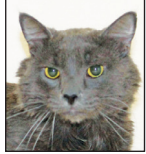
Ash male, 4-year-old Russian Blue mix.