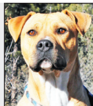
Autumn , approx. 3-year- old female terrier/American pit bull mix.