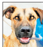
Chance , happy 1-year-old shep- herd mix. Knows doggie door, loves people.