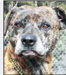
Vinny male 8-1/2-year- old Cur, Mountain mix.