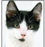
Domino male, 2-month-old domestic short hair mix.