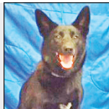
Jinx , female, 1/12-Ger- man shepherd/ labrador.