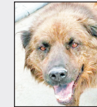
Vegas , happiest brindle chow male at 6-years- old. Loves people, walks.