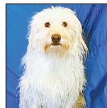
Annie , female, 3-year-old, terrier.