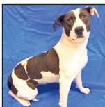
Sadie female, 2-year-old pit bull.