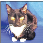
Val male, 1-year-old, domestic short hair.