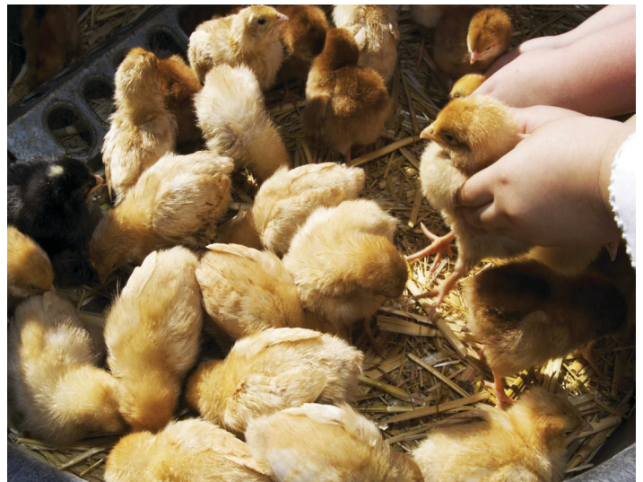
Figure 2. A risk of contracting Salmonella from chicks is always present. However, the risk can be reduced by avoiding contact with feces from these animals, carefully washing hands with soap and water after handling these animals, and avoiding hand-to-mouth contact.

If any of the children have high fever, severe diarrhea or other symptoms, contact a health care provider.