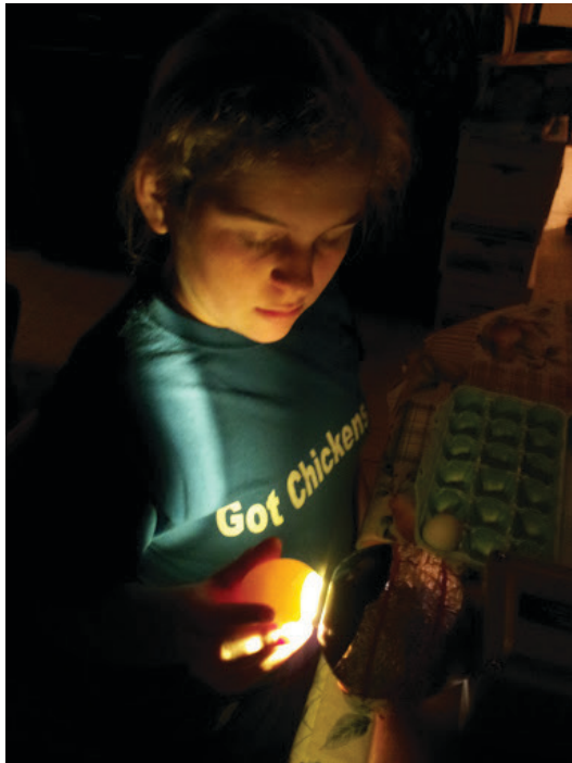
Figure 1. Candling eggs. Educational embryology projects such as those offered by 4-H groups allow children to learn how life develops through observing eggs in an incubator.

Roxanne Connelly, Christopher Mores, and Amy H. Simonne 2