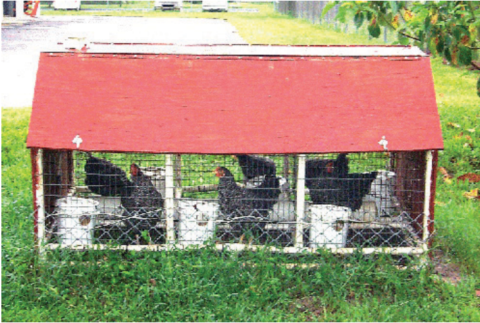
Figure 3. Sentinel chickens.

Eastern equine encephalitis (EEE), St. Louis encephalitis (SLE), and West Nile (WN) viruses are present in populations of wild birds in Florida. The birds become infected through the bite of a virus-carrying mosquito. These viruses cannot be transmitted from person to person or from consumption of chicken eggs or meat. There is a risk that some infected birds can transmit the virus to humans under certain strict circumstances.