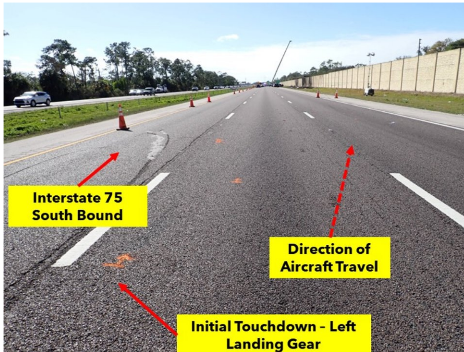
Figure 2 Annotated photograph of the airplane's initial touchdown point on Interstate 75.

The forward portion of the fuselage was consumed by the post-impact fire (see figure 3). All major components of the airplane were accounted for at the scene, and the ground surrounding the wreckage was fuel-soaked having an odor consistent with Jet-A fuel. The cockpit center console was found separated from the main wreckage. Both engine throttle levers were found near the IDLE stop position. The flap selector handle was found in a position consistent with 45° flap extension.