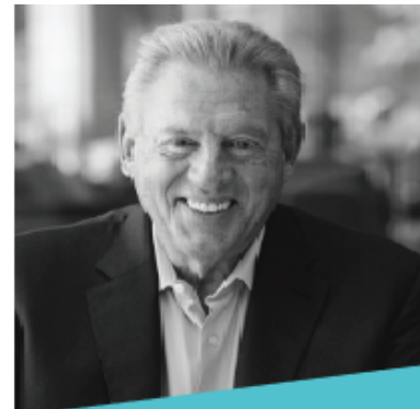
JOHN C. MAXWELL