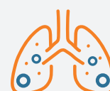
Difficulty breathing /shortness of breath