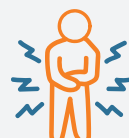
Muscle or body aches