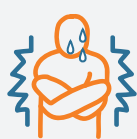
Fever or chills