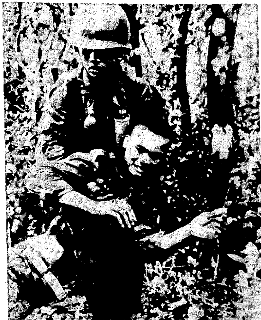
HELP FOR A BUDDY—A wounded Vietnamese paratrooper grips his teeth as a fellow paratrooper drags him through jungle toward safety in the rear during an attack on Viet Cong positions near Binh Gia Mon-