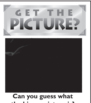
the bigger picture is?