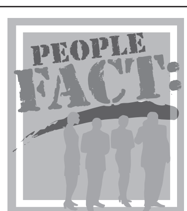
WHAT FLOWER IS LOVED BY MANY PEOPLE, SO MUCH SO THAT IT IS OFTEN CALLED "THE WORLD'S FAVORITE FLOWER"?