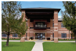
Southern Meadows Estates