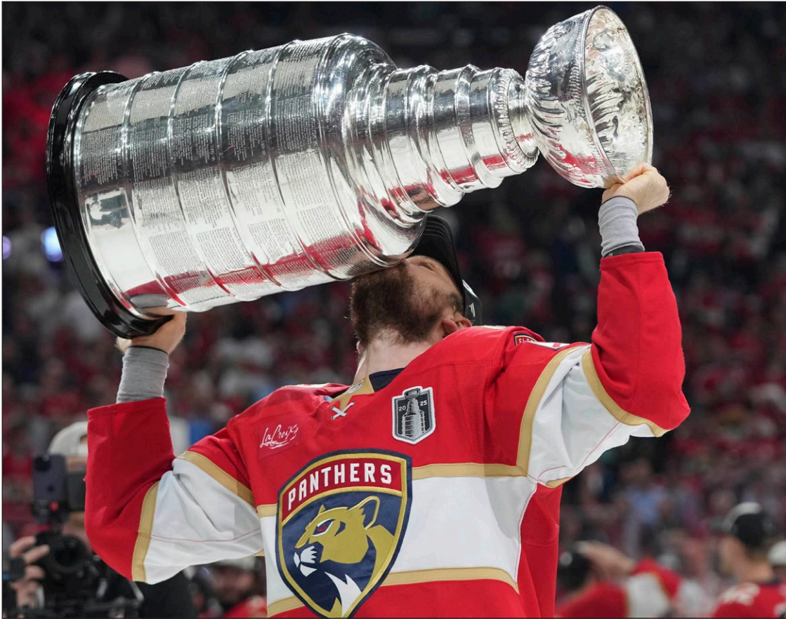
Florida Panthers center Sam Reinhart kisses the Stanley Cup after defeating the Edmonton Oilers in June. The Panthers enter the 2025-26 season as the two-time defending champions with plenty of teams looking to knock them off their throne.

For the already star-studded Golden Knights, Marnier is yet another superstar, joining Jack Eichel, Mark Stone, William Karlsson and Tomas Hertl up front, for one of the highest-powered offenses in the league. Will Marnier be enough to get Vegas its second cup in franchise history?