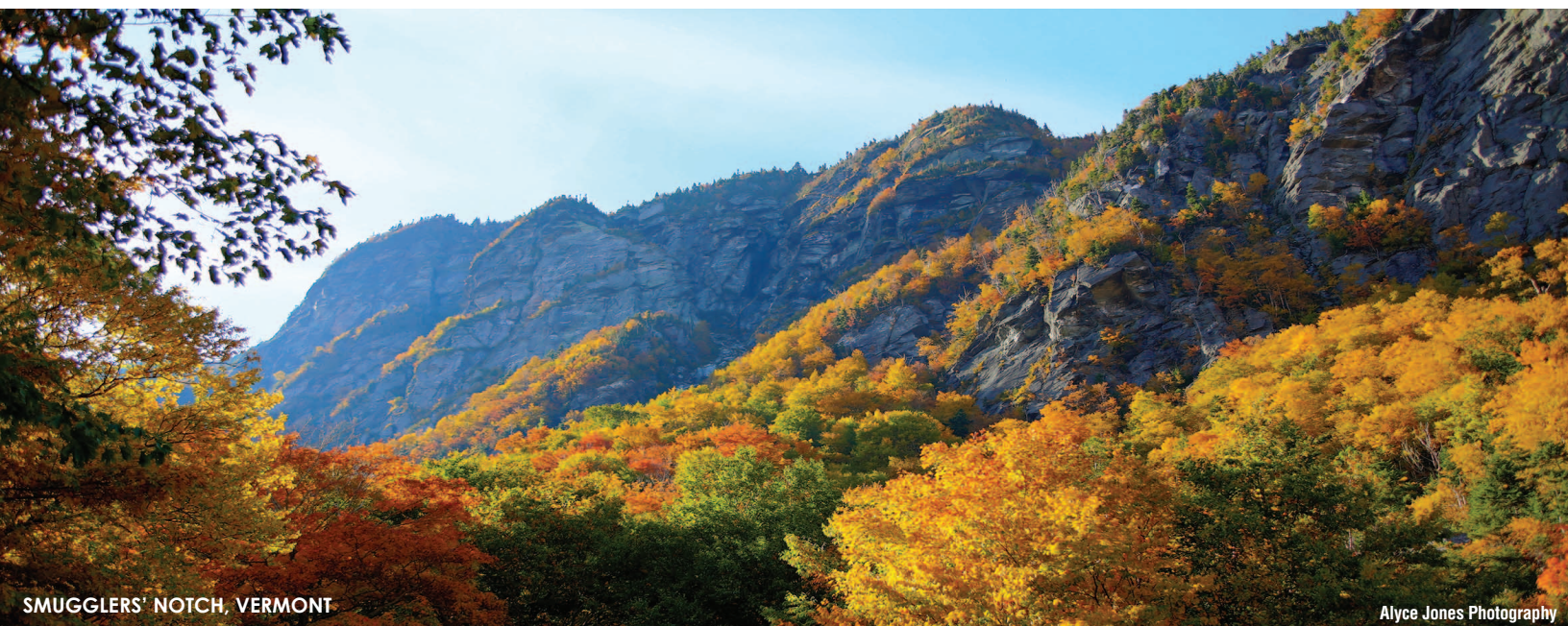
SMUGGLERS' NOTCH, VERMONT

Check out our new portal to our five great community newspapers, and keep up on local news throughout northern and central Vermont.