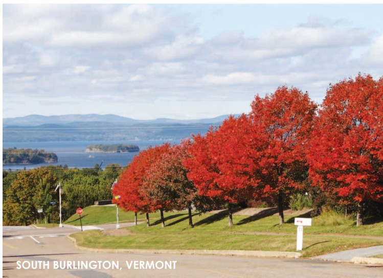
SOUTH BURLINGTON, VERMONT