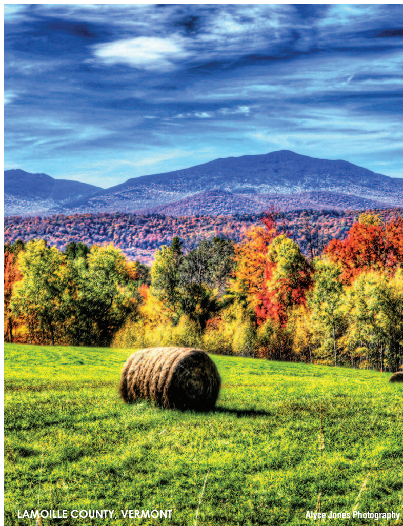
LAMOILLE COUNTY, VERMONT