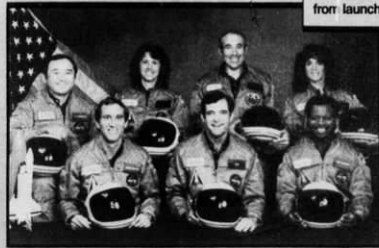
July Margolis, The Arizona Daily Star

10.35 miles high 8.05 miles downrange from launching pad