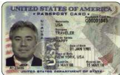
U.S. Passport Card

"Under 21" Any Drivers License or ID (Not Valid 30 Days After 21st Birthday) is in verticle format, with driver's image and "UNDER 21 Until" statement to the right.