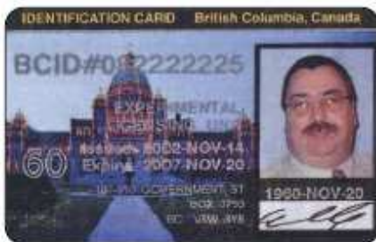
Canadian ID Card (from any Canadian Province)

The temporary Arizona driver license or identification card (which is valid for 30 days) contains a photo, date of birth and the basic information that will appear on the actual credential.