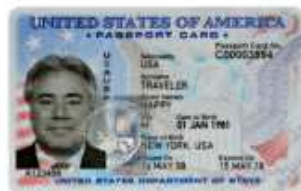
Any valid recognized Passport or US Passport Card