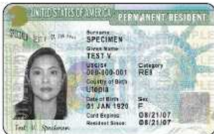
Resident Alien Card