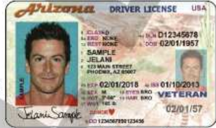
Any U.S. Drivers License (or Arizona ID card) issued by D.M.V.

The temporary Arizona driver license or identification card (which is valid for 30 days) contains a photo, date of birth and the basic information that will appear on the actual credential.