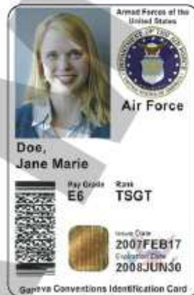
Military ID Card