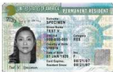
Resident Alien Card