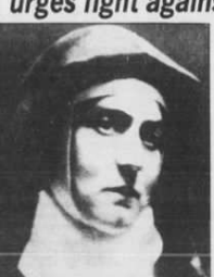
Sister Teresa, born Edith Stein