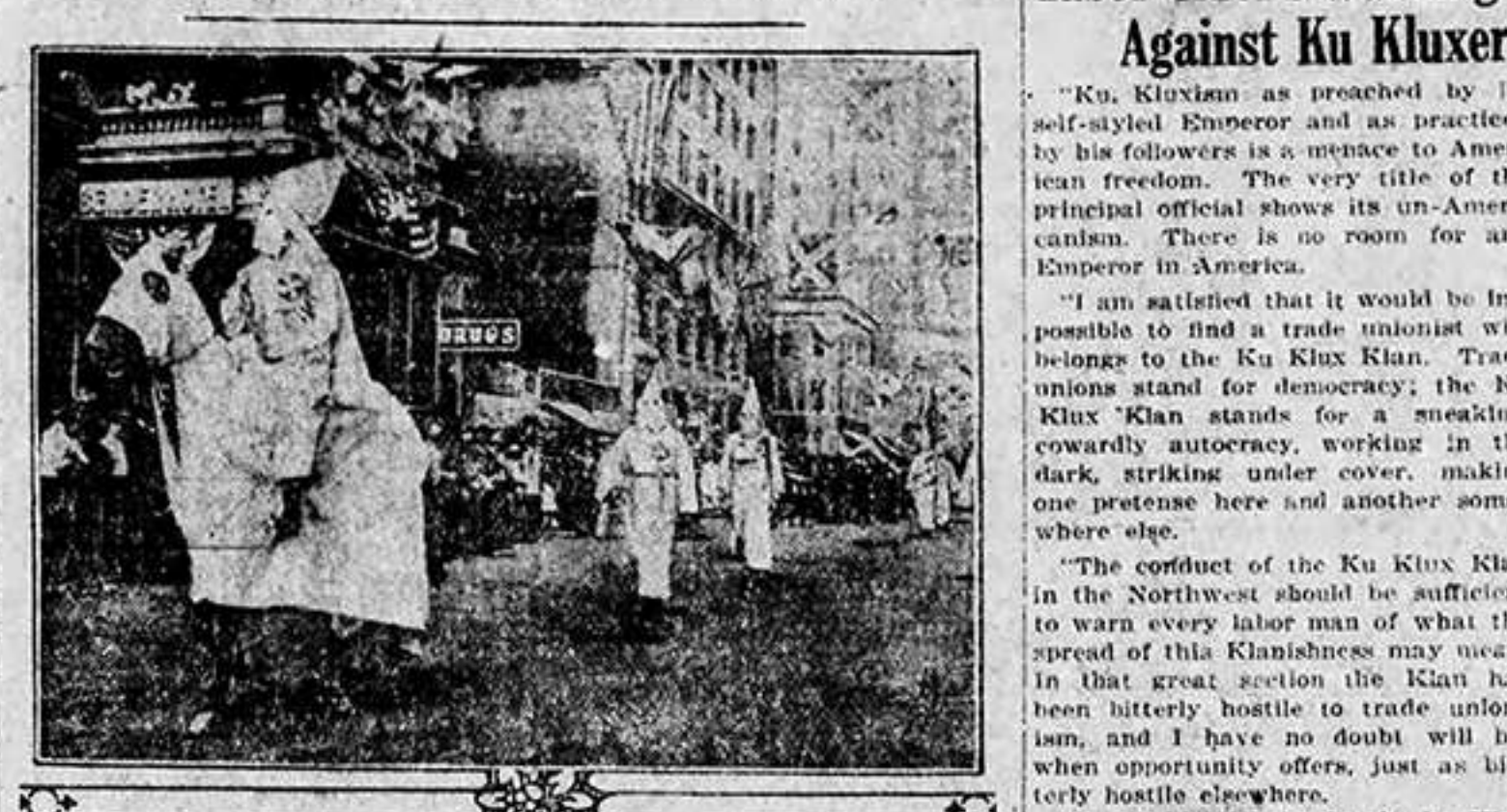
KU KLUX KLAN PARADE IN HOUSTON, TEXAS.

Enough examples have now been given of the hatred propaganda which circulates in Ku Klux circles to make it abundantly plain that when Emperor Simmons or his underlings assert that their order wages war on no individual or organization "regardless of color, race or creed" these smooth professions do not coincide with the facts as uncovered by investigation.