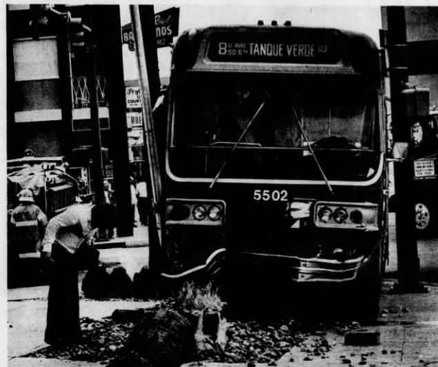
Accident aftermath — A Sun Tran bus inspector examines the downtown site where two pedestrians were struck from behind yesterday by a city bus that went out of control after colliding with a car. The 1:30 p.m. accident was at the intersection of West Alameda Street and North Church