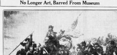
SUSPENSE EASED IN DEATH CASE "Insulin Quiet As Ban Lifts On Service Men's Lawyers; Civil Trial Assured"

No Longer Art, Barred From Museum You can't view the original of this picture now, for officials of the Metropolitan Museum of Art have withdrawn it from the gallery.