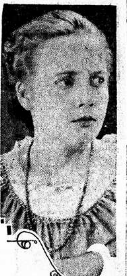
The first published photo of Lois Wilson as she appears in the title role of the film version of "Miss Lulu Bett." She looks the part.