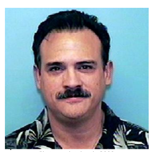
Photograph taken in 2009