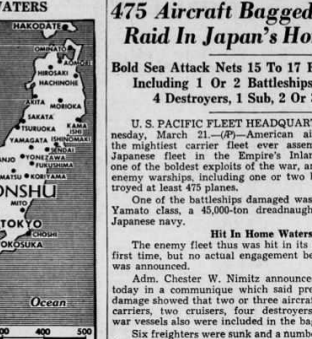
Carrier fleet which has been pouring planes against Kobe and Kure in the southern Japanese Inland Sea, attacked the enemy fleet in the Inland Sea, damaging 15 to 17 warships and destroying 475 aircraft, it was announced yesterday by Admiral Chester V. Nimitz.