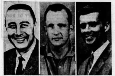
VIRGIL I. GRISSOM ... Veteran command pilot EDWARD H. WHITE II ... Spacewalk hero ROGER B. CHAFFEE ... Rookie astronaut