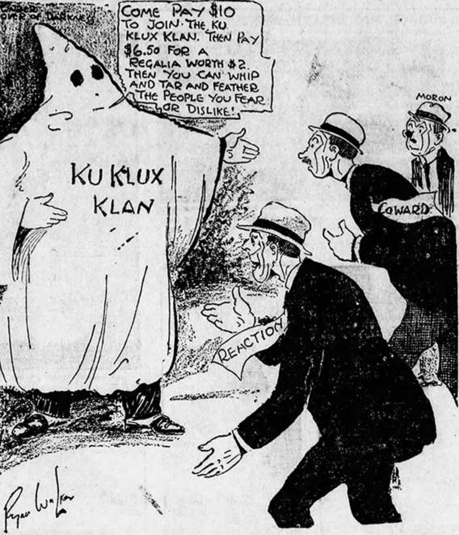
The Klan and Those Who Join. From The New York Call of September 7