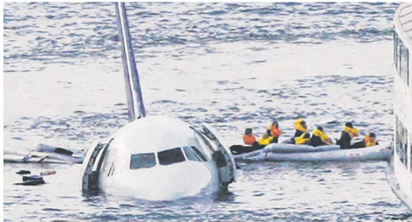
Passengers in an inflatable raft move away from the US Airways aircraft that went down Thursday in the Hudson River in New York. A paramedic said a woman had two broken legs, but there were no other major injuries.