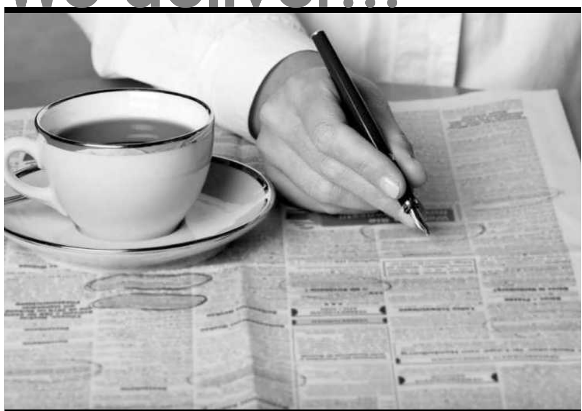
View All Our Listings at www.johnstownparealestate.com

Jobs, homes, autos, merchandise, yard sales, pets... We've got it all and more in our Classifieds section. Opportunity is knocking and it just landed on your doorstep.