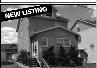
WEST END - $39,900 545 W. Howard St. Don't miss this 3 BR/1 BA vinyl-sided w/level fenced rear yard & detached garage w/workshop area.

Very nice 2-story duplex that could be converted to a single-family home!