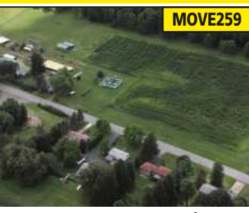
1171 Penn Ave., Conemaugh Twp. Come explore this well-known recreational farm venue! Farandaís Farm sprawls across 44+ acres and is minutes from Rt. 219. Includes 3-4 bedroom farmhouse, barn, veranda, carports, restrooms, shower house, gazebos, and so much more. Call today for all the details! $399,900