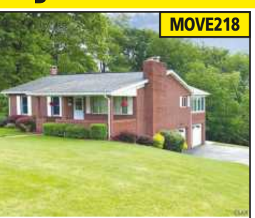
Adams Twp. Approx. 1.2 acres surround this brick rancher with 3 bedrooms, 2 baths, light-filled living room with fireplace, open kitchen/dining room, abundant double closet bedroom storage, possible lower level 4th bedroom, 2 car garage, and storage shed. $189,900