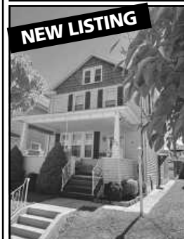
FERNDALE $78,500 720 Summit Ave. You will appreciate the pride in ownership in this 3 BR/3 BA vinvl-sided

Lovely 3 BR/1 BA vinyl-sided old farmhouse has a 2-car detached garage & sits on