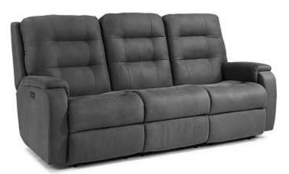
Arlo Reclining Sofa W. Power Headrests 44H 87W 45D

Recliner 41H 37W 45D Rocking Recliner with Power Headrest