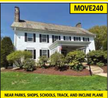
439 Orchard St., Southmont Boro Ownership pride shines in this lovely home with 7 bedrooms, 3 1/2 baths, hardwood flooring, comfortable living room with fireplace, modern kitchen w/center island, appliances, and pantry, family room, abundant storage, slate patio, and 2-car garage.