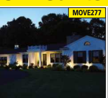
757 Viewmont Ave., Westmont Boro Magazine styling with professional design! Nearly one acre manicured lawn surrounds this open floor plan of elegant hardwood flooring, gourmet kitchen w/marble counters, 4 bedrooms, 3 baths, family room, central air, and 2-car garage. $475,000