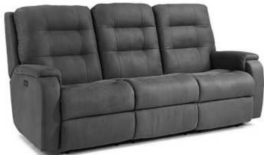
Arlo Reclining Sofa w. Power Headrests

Visit us at: www.youngamericanfurniture.com