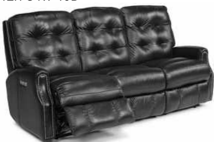
Rio Reclining Sectional 2904-Sect