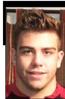
HUNTER PARK Southern Garrett