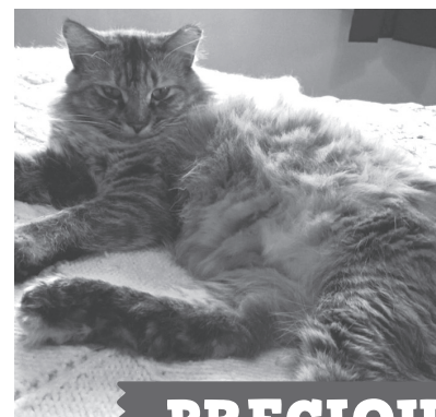
Meet PRECIOUS MAMA