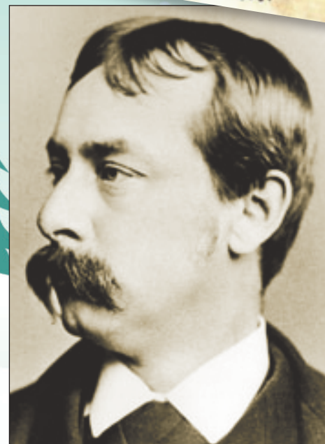
Francis Pharcellus Church

Dear Editor, I am eight years old. Some of my little friends say there is no Santa Claus. Papa says if you see it in The Sun it's so. Please tell me the truth, is there a Santa Claus? Virginia O'Hanlon 115 W. 95 St.