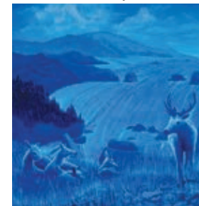
House of Orange