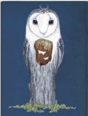
Valerie Savarie Altered book sculpture