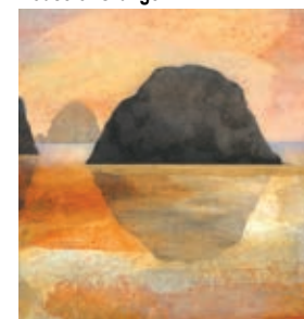
White Bird Gallery