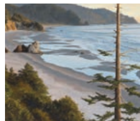
Jeffrey Hull Gallery