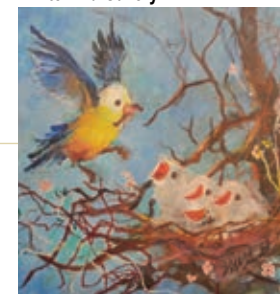
Steidel's Art Gallery