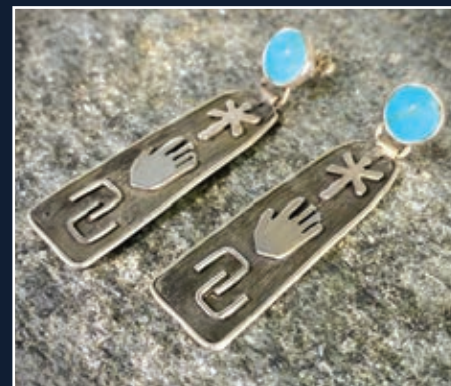
Robert Rogers "Celebration Earrings"