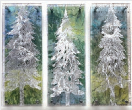
Ryan McAbery Photo & plexi map paintings