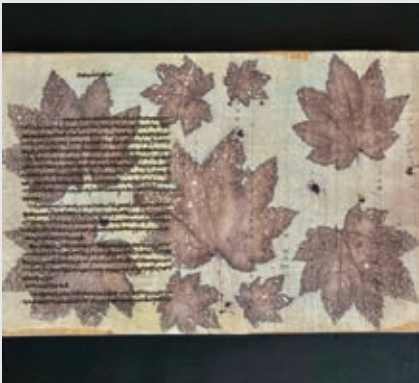
Helga Winter Eco-printed repurposed book art