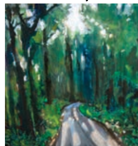
Shearwater Studio & Gallery