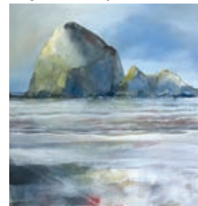
Northwest By Northwest Gallery