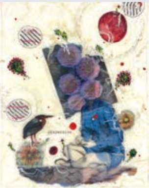
Nina Alderete Cold wax collage