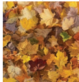
Cannon Beach Gallery