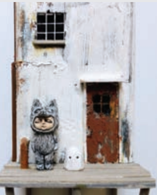
Dmitri Swain Architectural assemblage sculpture