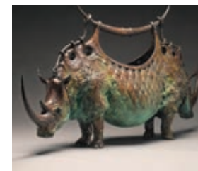
Bronze Coast Gallery