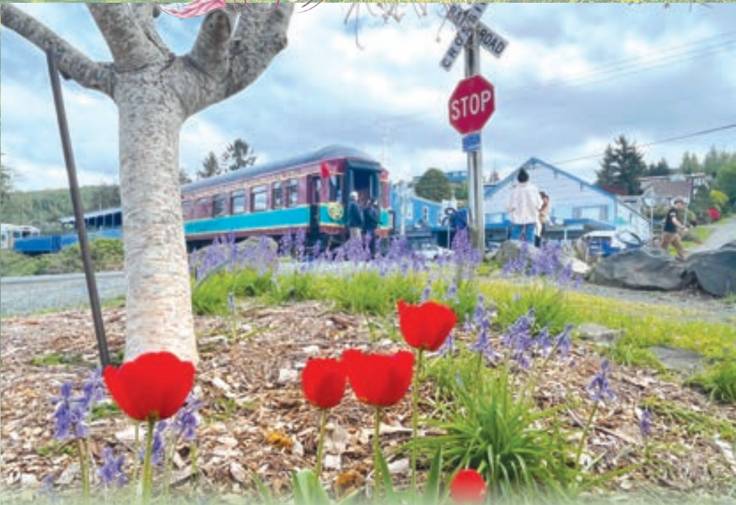
Stay active this spring with Community Events, pgs 3-4.