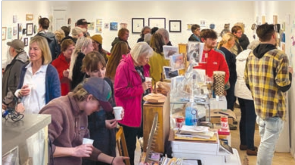
Cannon Beach Arts Association supports local arts through exhibits, education, and events. Art exhibits are often opened with a community reception.

CBAA next upcoming exhibition, "Travelers," is set to debut on Feb. 23, and will be on display until March 24. This exhibition will shine a spotlight on the exceptional talents of