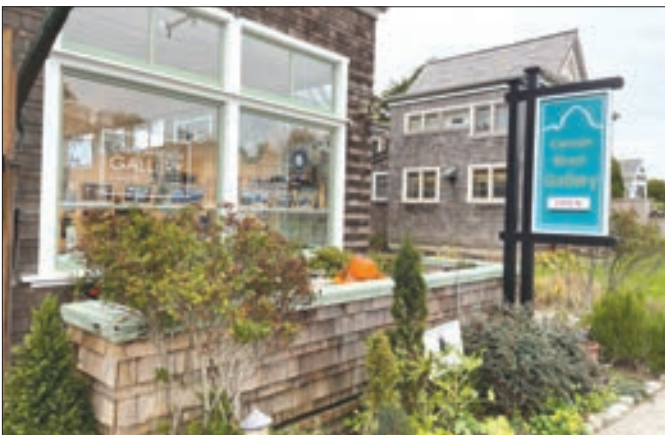
Cannon Beach Arts Association is located at 1064 S. Hemlock St. Cannon Beach.

The Cannon Beach Arts Association + Gallery is located at 1064 S Hemlock St., Cannon Beach. Winter hours are Wednesday - Sunday from 10 a.m. - 4 p.m. Summer Hours are 10 a.m. - 4 p.m., seven days a week beginning in May.