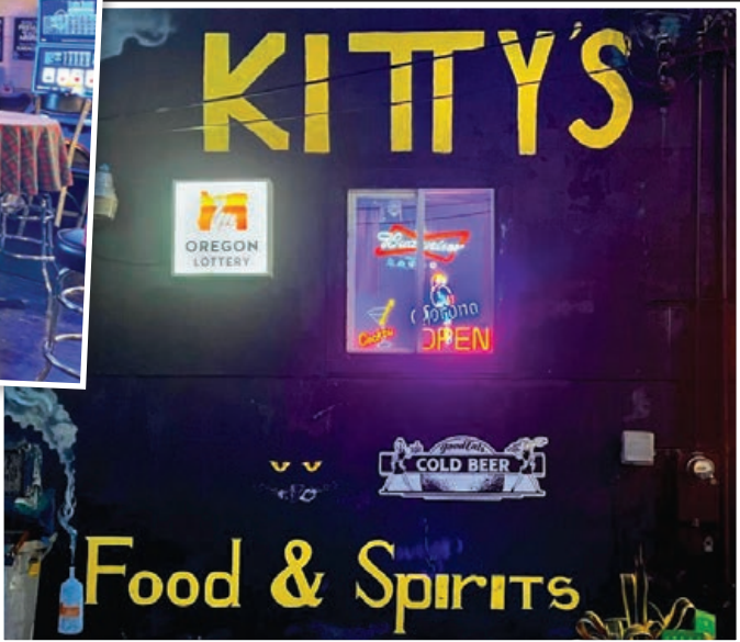
Lounge entry west parking lot