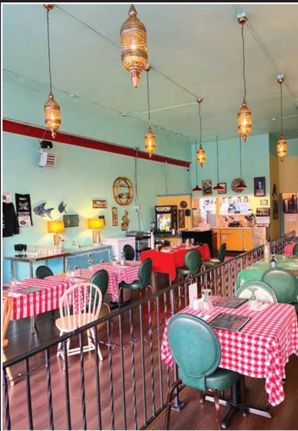
Kitty's main dining room