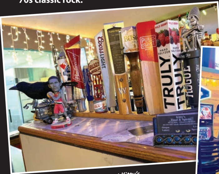
On tap at Kitty's