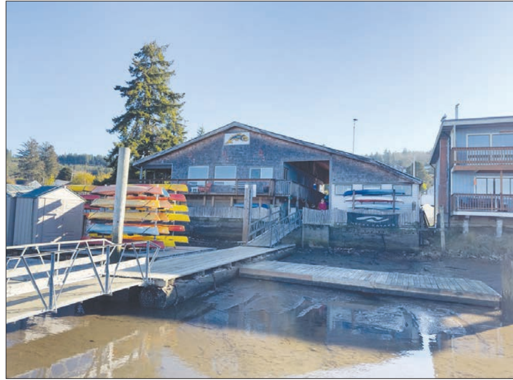
Wheeler Marina.