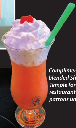
Complimentary blended Shirley Temple for restaurant patrons under 21