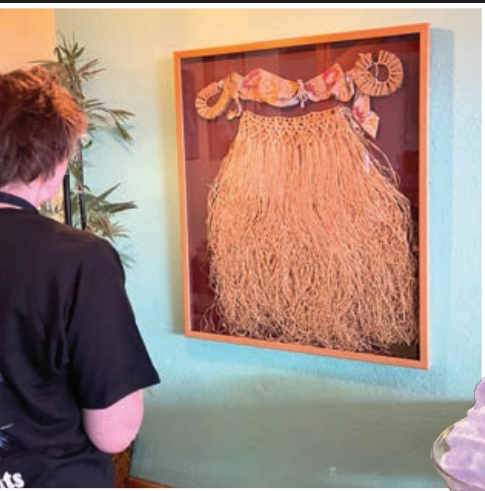
Circa 1953 Hawaiian Hula Outfit