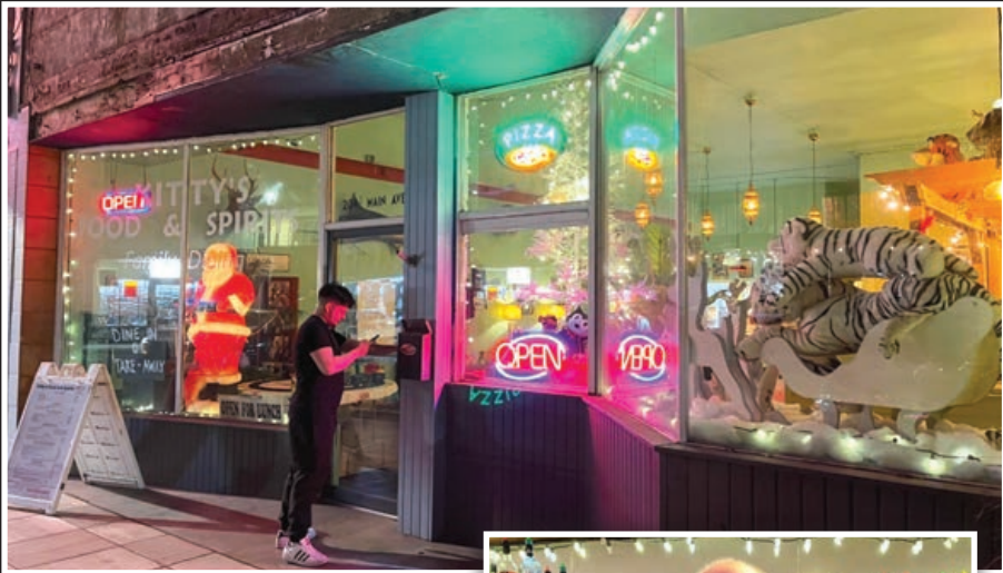
Main Street entry to Kitty's restaurant

Kitty's Food & Spirits features a family restaurant and a lively lounge all under one roof. Entering from the east side of the establishment on Main Street gets you into the restaurant. The lounge for patrons over 21 years of age is accessed through the west side, parking lot area.