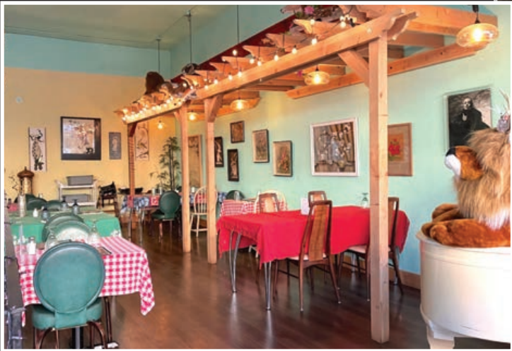
Upper dining area in restaurant

taco and margarita special. Food is also available in the lounge. Wherever a patron sits, on their birthday, they are always eligible for a complimentary piece of cheesecake.