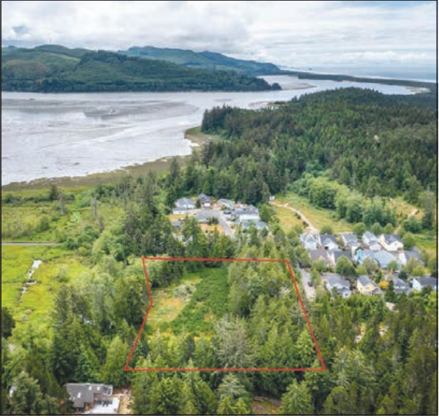
3 ACRE DEVELOPMENT land with view of Nehalem Bay, just outside Manzanita. Multi-use zoning. Utilities nearby. Mostly level. MLS 22-412 $659,000 Mary Kay Campbell, Broker