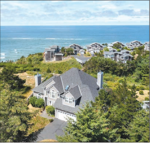
CIRCULAR DRIVEWAY on nearly half acre in The Capes. Panoramic ocean view. 3316 sq ft, English style architecture, quartz kitchen. MLS 22-435 $1,295,000 Pam Zielinski, Broker