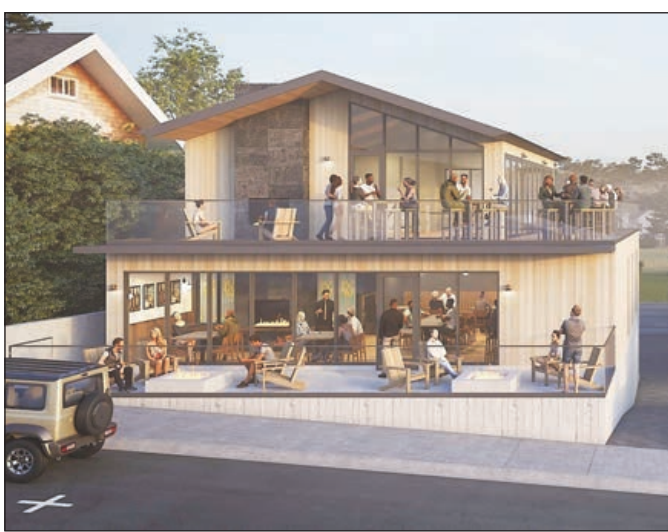
Architectural rendering of Steeplejack Brewing showing the outside seating.