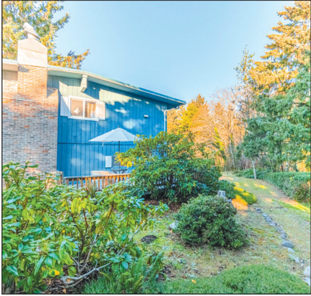
SECLUDED SETTING on nearly 1/3 acre. Situated at Roads End with ocean view close to hiking trails and beach access. 1552 sq ft. MLS 22-2368 $599,000 Michelle Carlon, Broker