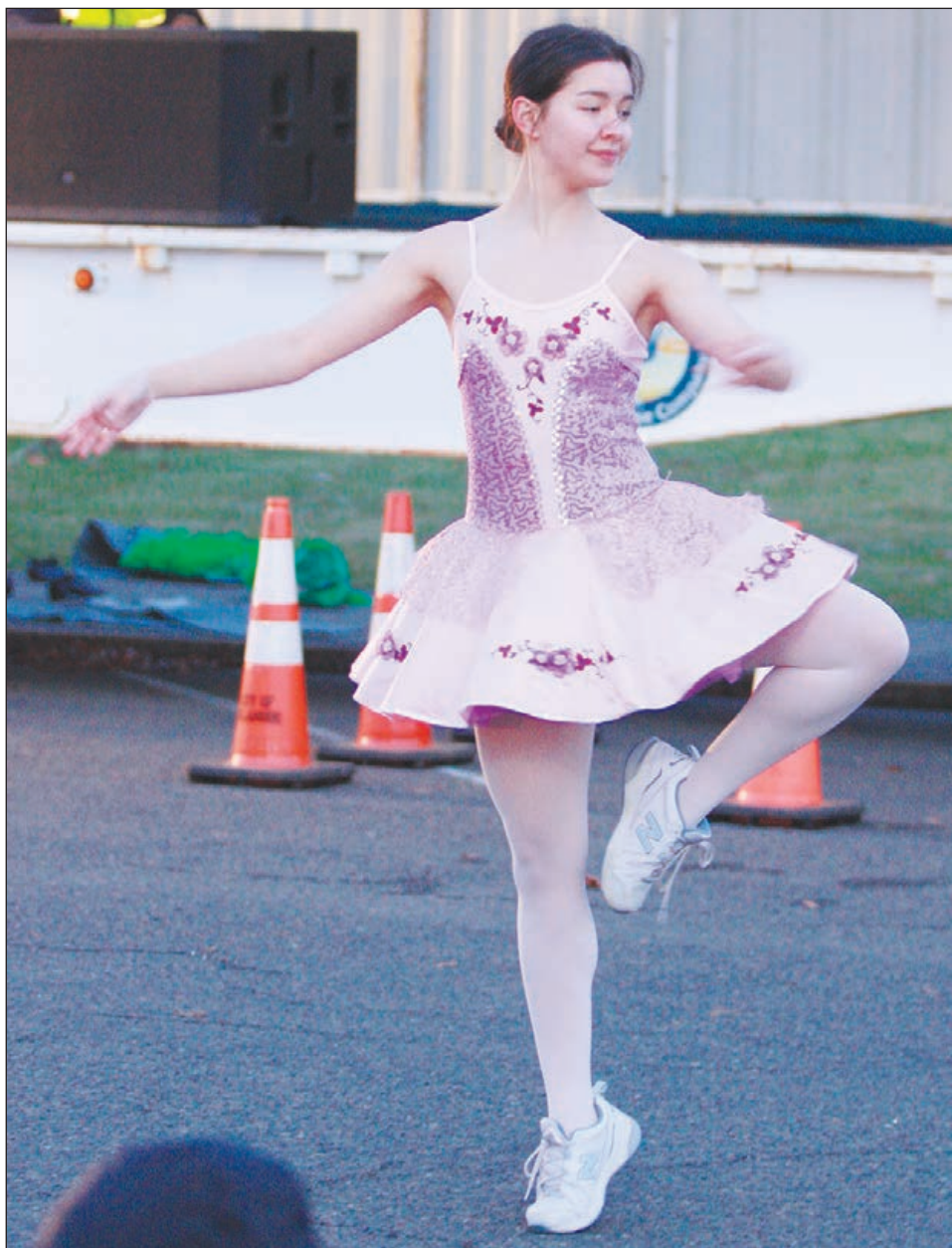
The City of Tillamook hosted the annual Tree Lighting and Holiday Light Parade Saturday officially kicking off the holidays in Tillamook. The crowd was entertained by dancers from the Oregon Coast Dance Center along with food, coloring contests, a visit from Santa and of course the Light Parade.