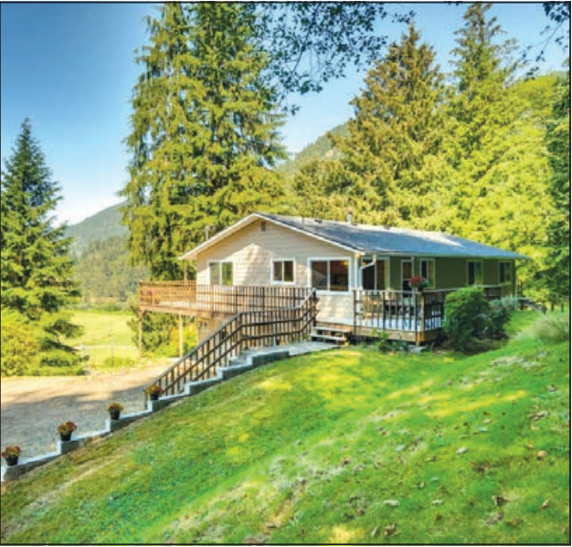
SECLUDED 2 ACRES with inspiring valley view. Entry level living plus daylight basement. 4 bdrm 3 bath, heat pump, EV charging station. MLS 22-515 $599,000 Alison Underwood, Broker