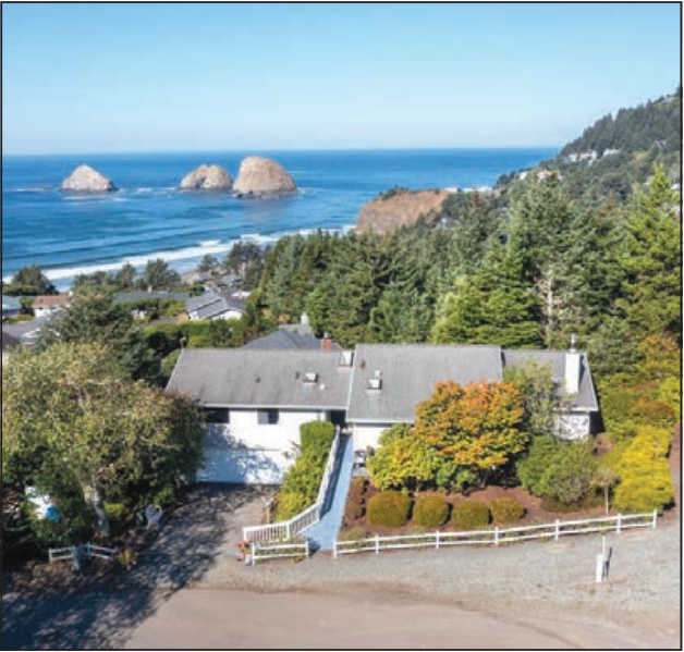
AWESOME VIEW OF THREE ARCH ROCKS in quiet outskirts of Oceanside. Entry level living plus daylight basement. Quartz kitchen. MLS 22-546 $895,000 Pam Zielinski, Broker