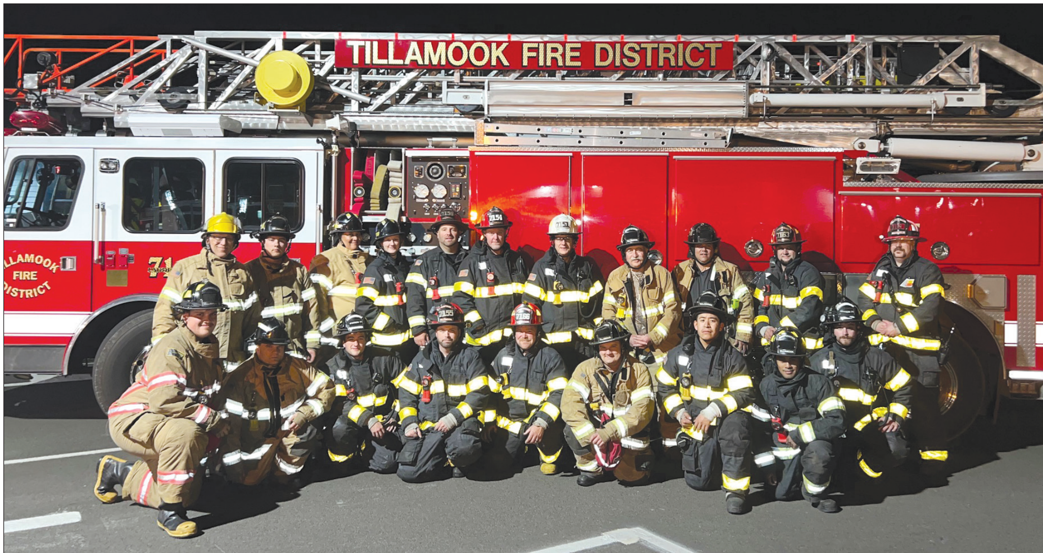
The Tillamook Fire District firefighters in front of engine 71.