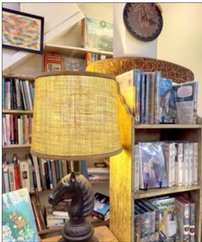
Find home decor treasures at Heart of Cartm.