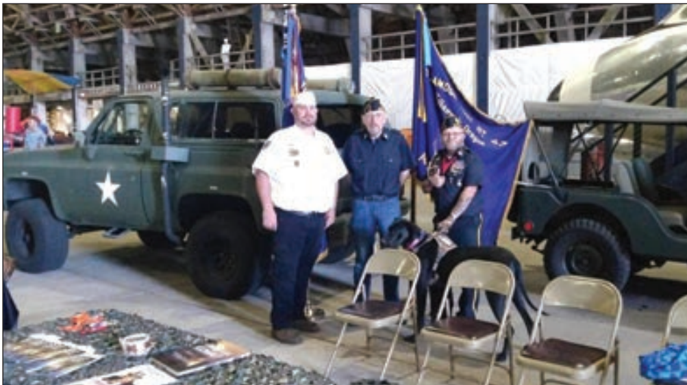
American Legion Post 47 still growing and helping veterans across the county.

American Legion Post 47 has hit its one year anniversary of being back in Tillamook. We have a Facebook account https://www.facebook.com/groups/6320116218064876 and web page https://tillamookpost47.com/ . The Post has participated in the fair and the 80th anniversary with the air museum. They are working with other clubs to have events for veterans to come to. We will raffle wood flags and other things the post has to help established a connection with Tillamook businesses. We have grown to 73 members and will have a 1953 Willis Jeep in the parades this summer.