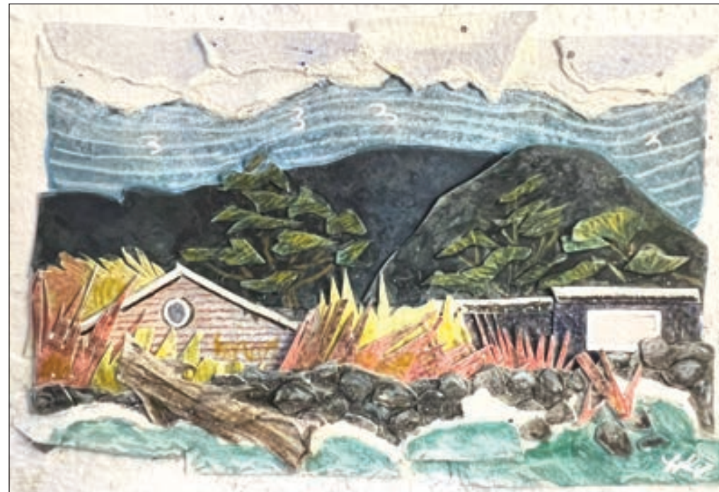
Keeping At Bay by Lindsey Aarts