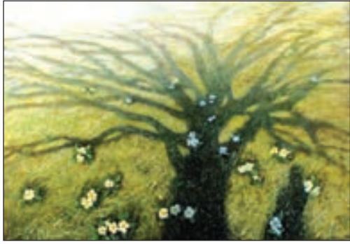
Deborah DeWit "Shadow Play" oil on wood, 21" x 30

Shop local for original works or art and repurposed home decor, continued