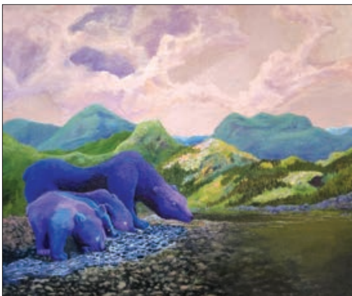
"Blue Bearies" is an acrylic painting by resident artist Greg Scott Brownlow.

A one-month invitational show, See Creatures brings together over 10 talented Northwest artists in an exploration of creatures from the sea, the land and the imagination. Hosted by the new House of Orange Gallery, See Creatures will debut during Cannon Beach