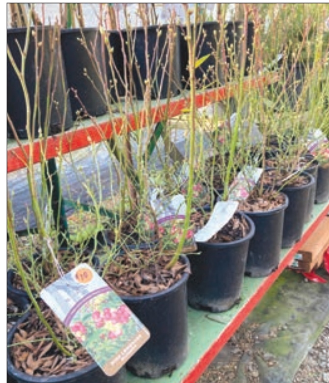
Blueberry bushes for sale at the home and garden show, featuring the Pink Lemonade variety.