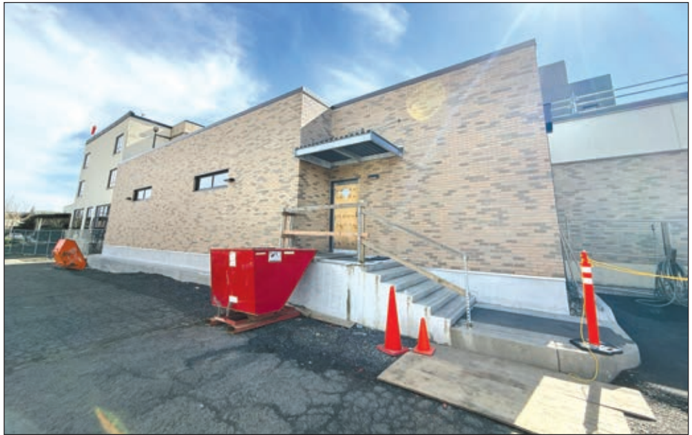
The new building’s exterior faces the hospital’s rear parking lot which will be largely repaved later in the construction process.

Skanska USA Building is overseeing the $18-million project, which broke ground in fall 2024 and is being undertaken to meet expanding surgical needs at the hospital and to fix an issue in the foundation of the existing operating rooms that were built in 1995. The new 4,500-square-foot addition is at the hospital’s north side and will feature four state-of-the-art operating rooms, as well as ample