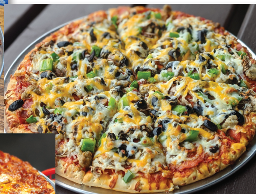
Main Street Special