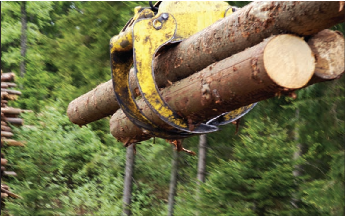
The timber harvesting funding provides local communities with the means to construct new county buildings; develop fairgrounds and museums; support libraries, schools, and jails; and build flood-control dams and reservoirs, according to the BLM.

The timber harvesting funding provides local communities