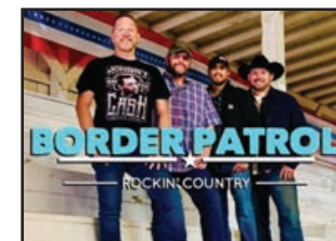
BORDER PATROL ROCKIN' COUNTRY