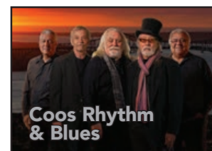
Coos Rhythm & Blues