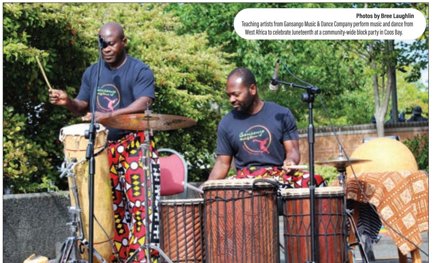
Teaching artists from Gansango Music & Dance Company perform music and dance from West Africa to celebrate Juneteenth at a community-wide block party in Coos Bay.