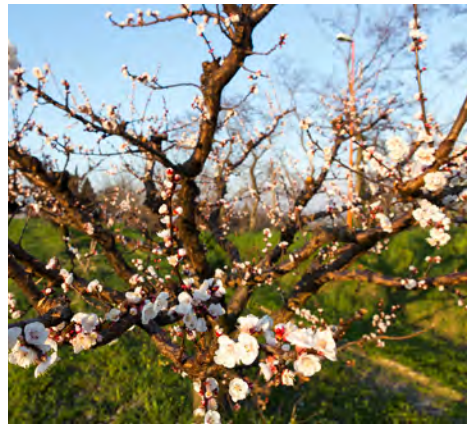
A wet winter and spring have led to lush trees and grass in our area. This means an increase in pollen which can cause misery for allergy sufferers.

To help relieve symptoms, over the counter medications are a good first step and are readily available.