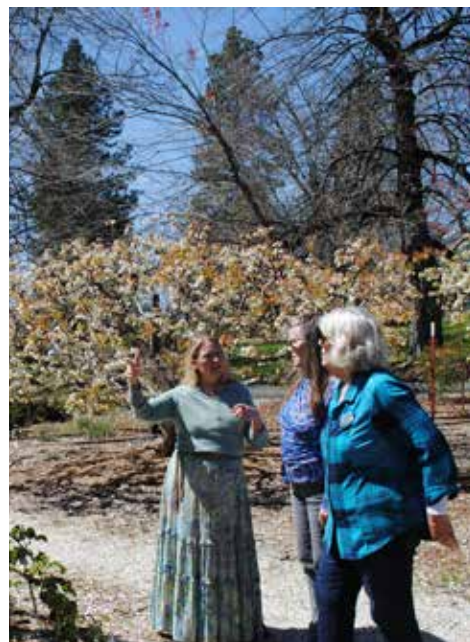
Master Gardeners and friends enjoy the pear orchard in early Spring.

Our Master Gardeners Live Radio Program can be listened to every weekend on Saturday from 10:00 a.m. to 12:00 p.m. on KNCO (look for 830 on the AM dial, or stream on iHeart Radio). We have different volunteer hosts each week, and we encourage listeners to call in with home gardening questions or comments about their gardens. The listener call line at KNCO is (530) 477-5626 , or the text line is (530) 913-4685. In addition to our website, look for UC Master Gardeners of Nevada County on Facebook and Instagram.