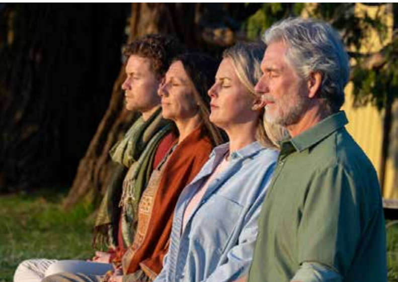
The Expanding Light Retreat welcomes everyone of diverse backgrounds to meditate on freedom and peace.

Yogananda encouraged surrender—not as weakness, but as freedom. Do your best, then release attachment to the results. A helpful evening practice: mentally offer your day—its wins, mistakes, and worries—into a bonfire of peace. You’ll sleep better and live lighter.