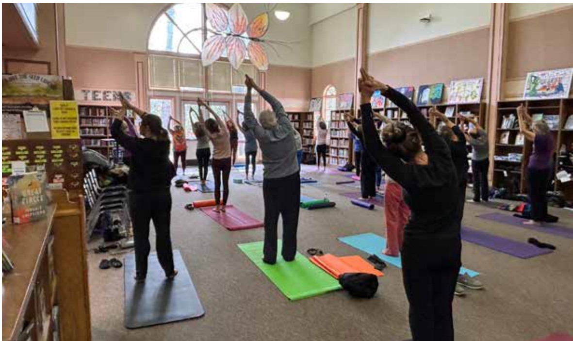
Qigong in Madelyn Helling Library.