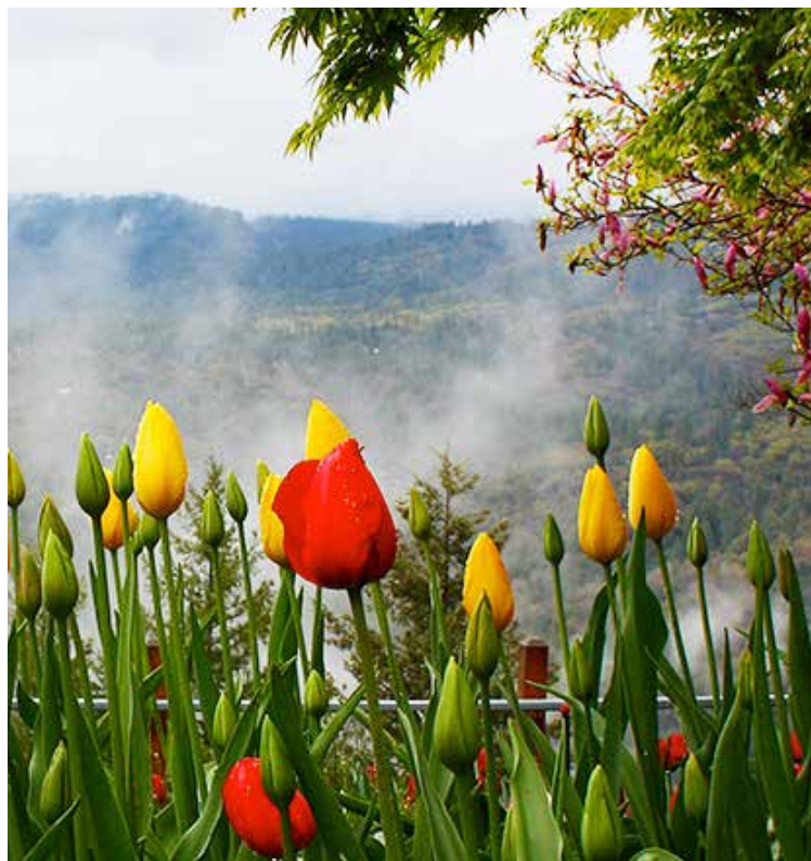
The beloved tulips at Ananda remind us to pause and savor the moment of the season.

How wonderful would it feel to finally still your mind and experience peace? Take the next step on your meditation journey. Learn more at ExpandingLight.org .