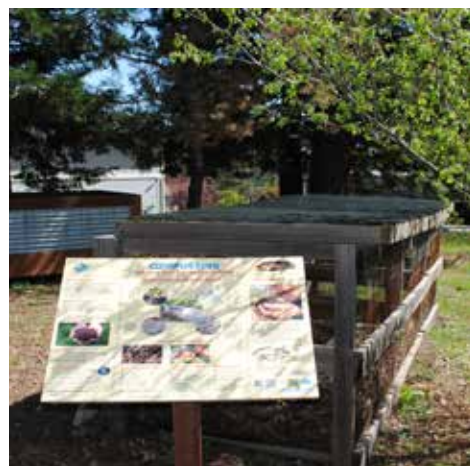
Educational and regenerative, the compost system at the Demonstration Garden informs and supplies gardeners with compost all over Nevada County as well as being a self sustaining operation.