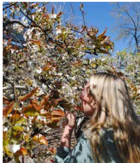
Smelling the pear orchard tree.