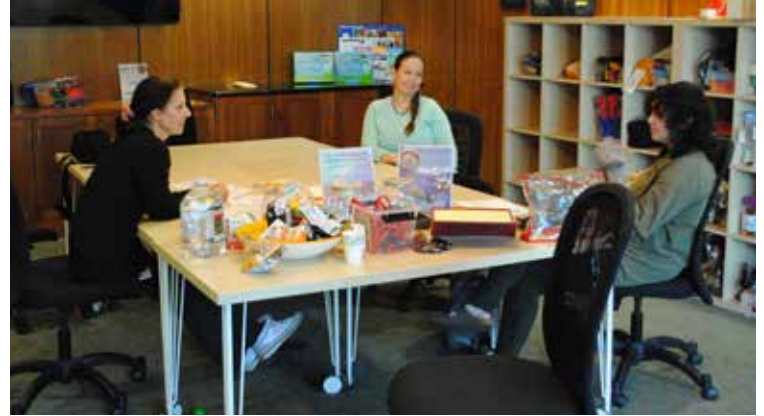
Experts and Specialists meet with parents in a friendly and welcoming atmosphere.

We provide guidance on early childhood development, outline