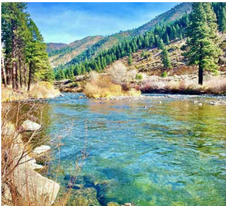
Some local organizations have begun PFAS contamination mitigation and cleanup.

“The moment we started hearing the same heartbreaking story over and over: parents losing kids to rare cancers, young people facing lifelong thyroid issues, veterans with unexplained illnesses—and all of them drinking from the same wells, living near the same bases. That’s when it stopped being just a policy issue. It became personal because the damage was personal.”